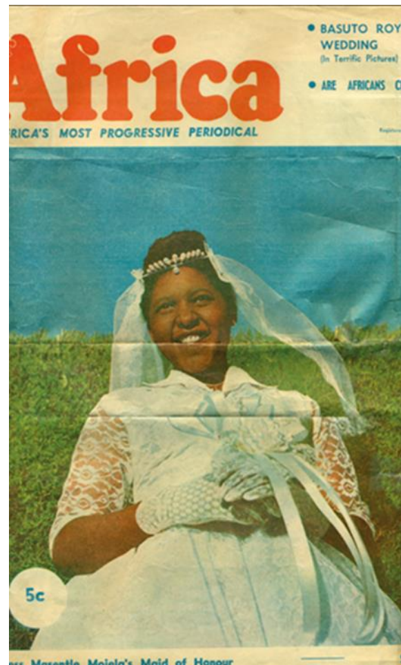
Figure 2: Front cover of the publication, Our Africa , showing the maid of honour's dress for the 1962 Lesotho Royal Wedding