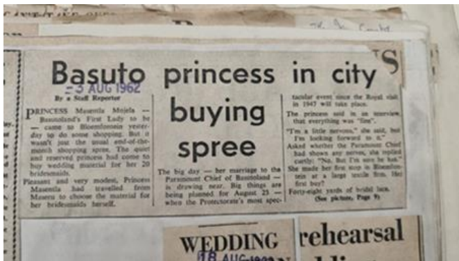
Figure 1: A newspaper clipping covering the purchase of the lace bought in Bloemfontein

and The Lincoln Star played a role in publicly celebrating black excellence, creatively retaliating against a system that refused to see this excellence.