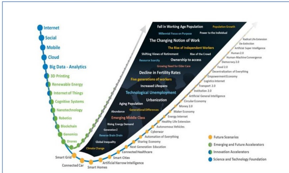
Figure 1: A summary of disruptive technologies (Fisk, 2017)

physical, digital and biological spheres. Figure 1 below summarises these major disruptive technologies, the change they drive, and the emerging opportunities: