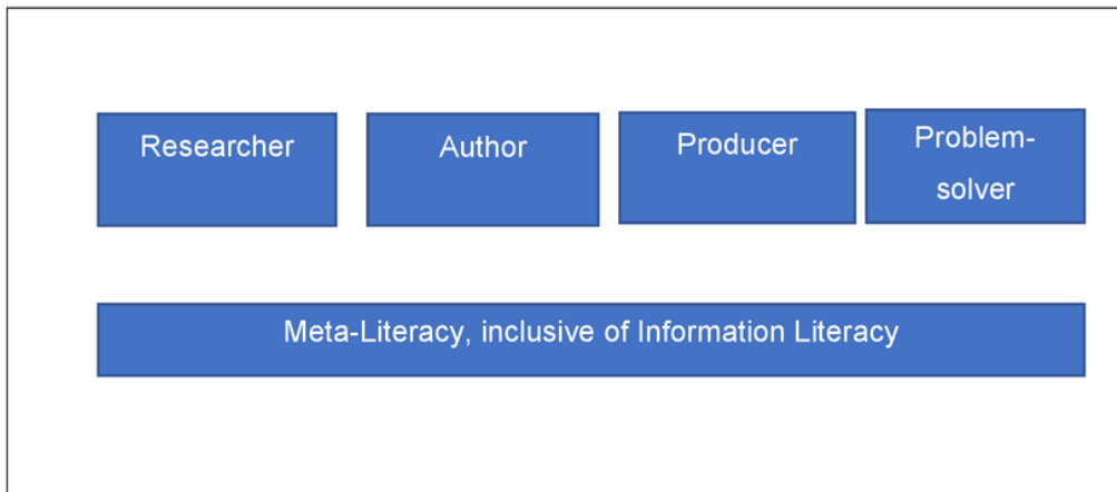
Figure 2: Framework of meta-literacies to be included in library information literacy programmes to support workplace literacy

Aligned to the meta-literacies framework (see figure 2) that academic libraries can adapt to support academic departments in developing workplace literacy skills, Table 1 indicates that skills related to information security, information privacy, problem-solving, ethical conduct and web-navigation rate high on the importance level. Aligned to the meta-literacies framework, academic libraries should include detail related to information literacy (the ability to find and utilise information related to various information sources), technology management, ethics and problem-solving as key focus areas in programmes offered to students within the tourism and hospitality industry.